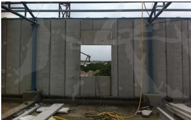
Cement Board/ Panel