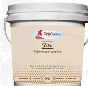
Tilo-Polymerized Adhesive (For tile & stone pasting) Coverage: 03 sq.ft. per Kg