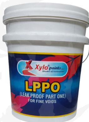
LPPO-Leak Proof Part One (For arresting fine pores) Coverage: 40-45 sq.ft. in two coats, per Kg