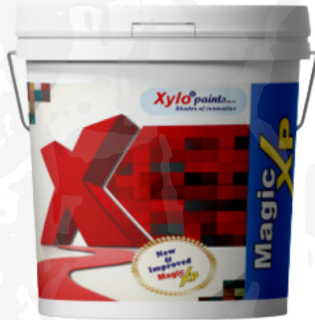
Magic Xp-Elastomeric Paintable Putty/Plaster Coverage: 150-200 sq.ft. per 20 Kg