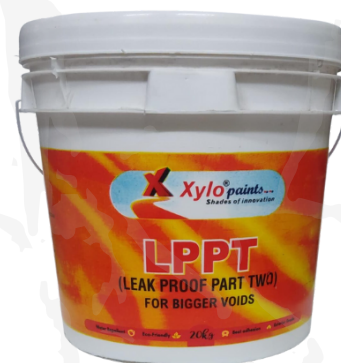
LPPT-Leak Proof Part Two (For major cracks and voids) Coverage: 7-8 sq.ft. in two coats, per Kg