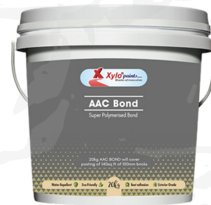
AAC Bond- Super Polymerized Bond Coverage: 60 sq.ft. on 150 mm width per 20 Kg