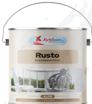
Rusto - Rust Inhibitive Primer (For MS surface) Coverage: 65-70 sq.ft. per Ltr in two coats