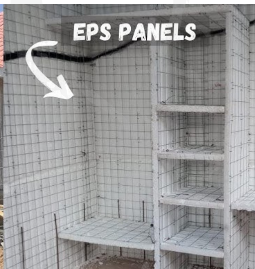
Precast and EPS Panel